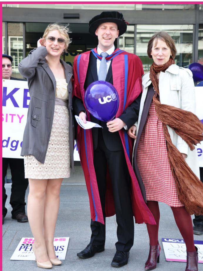
March 24th: The College Dean, a proud student and a supporter show their backing for the strike