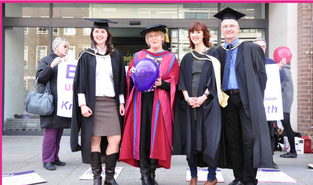
March 24th: Students joining in the colourful protest outside the College