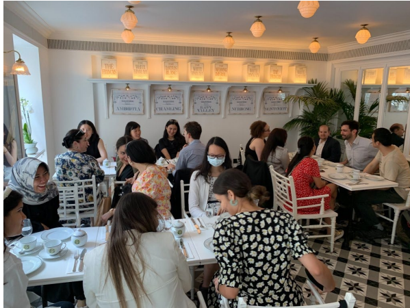
Afternoon tea at Covent Garden