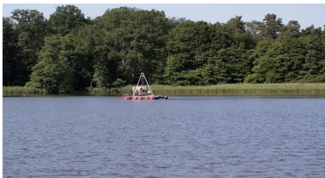
The research team extracting sediment from Lake Hamelsee