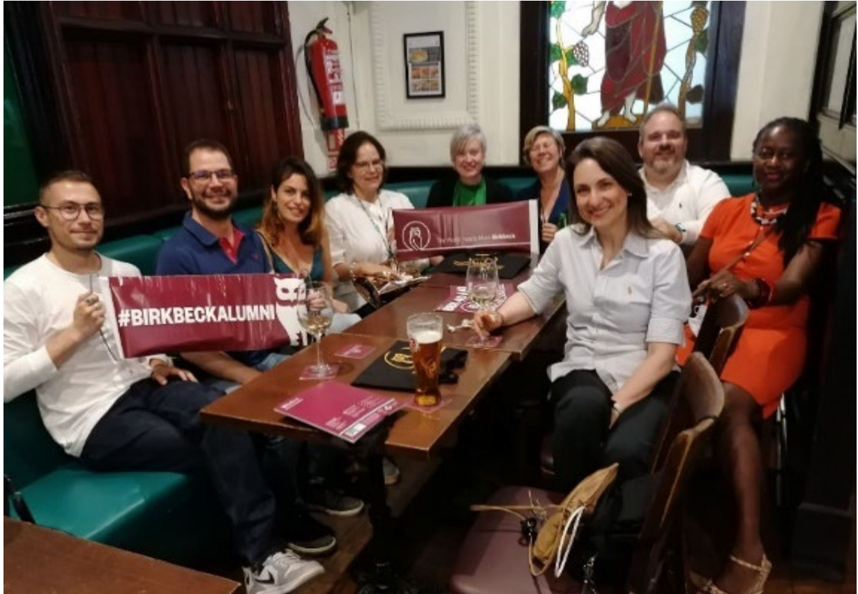
Madrid Alumni Reception, June 2022

Birkbeck's international alumni also continued to make significant strides in different walks of life during the 2021-22 period, as reflected in the paragraphs and Box 9, below.