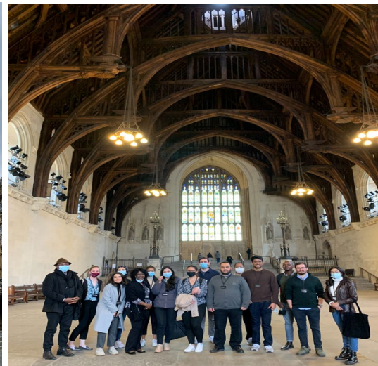
International students touring the Houses of Parliament