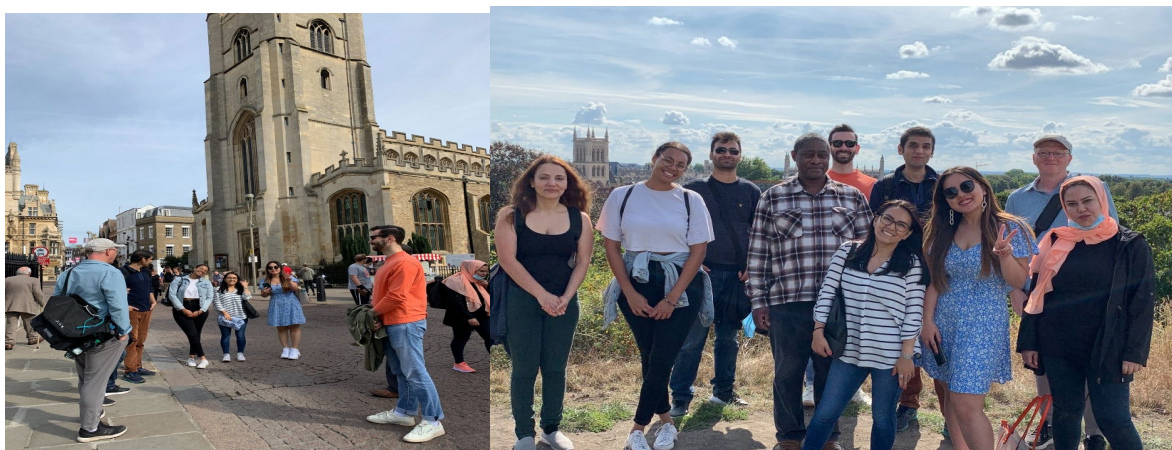
Day trip to Cambridge