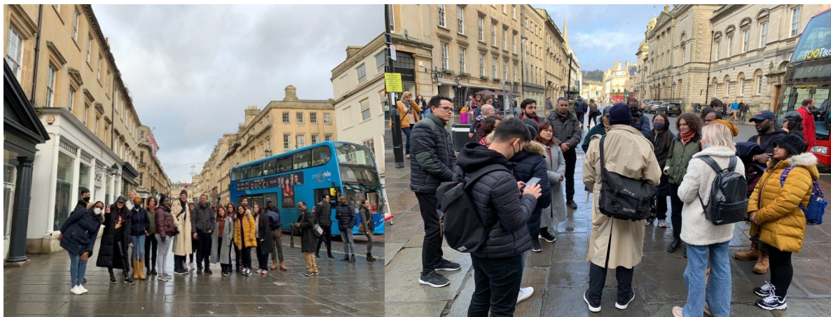
Day trip to Bath