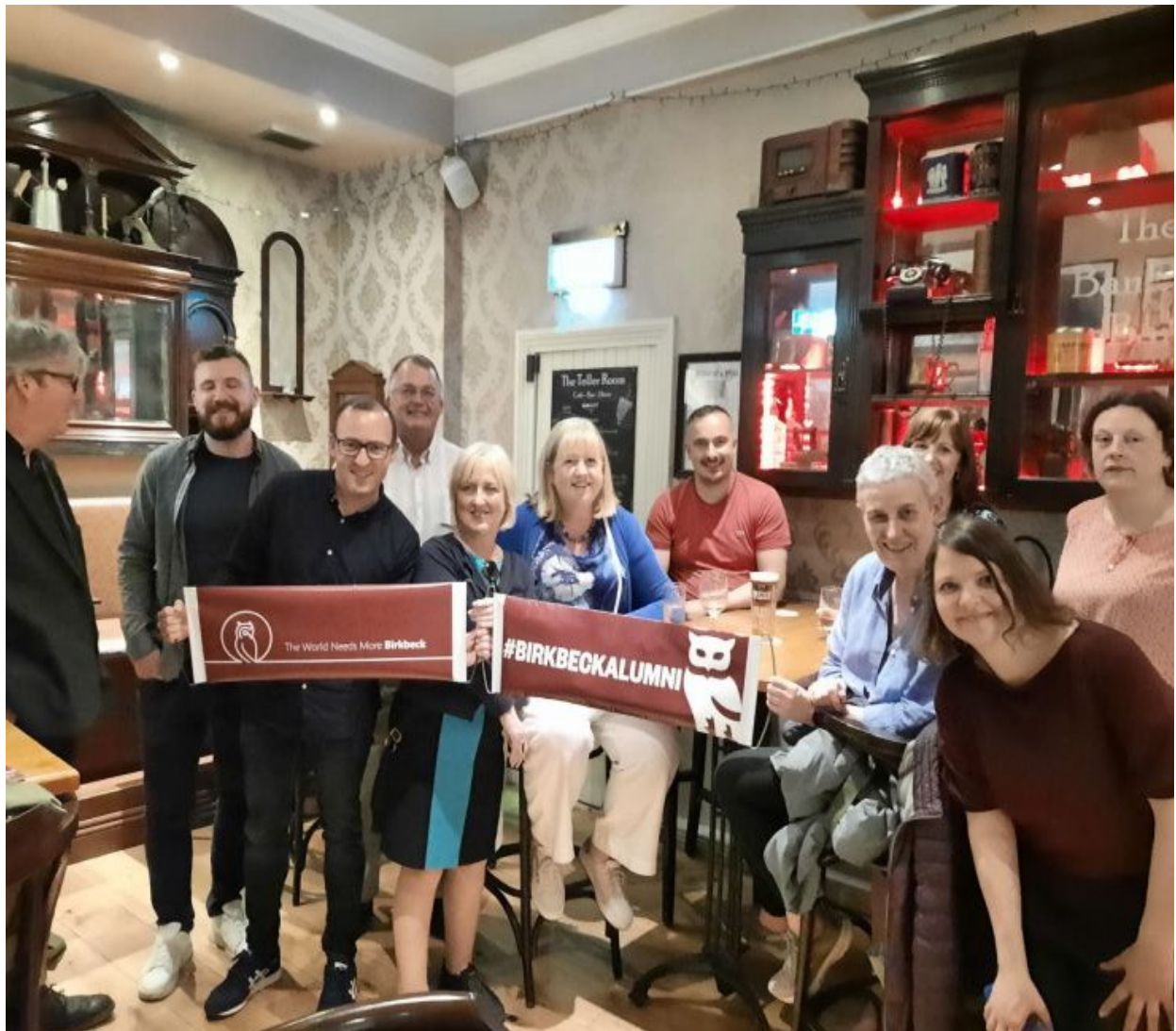
Dublin Alumni reception, June 2022

During the year, and as part of The World Needs More Birkbeck campaign, the Alumni and Development team 'took to the road' to meet members of our alumni community in a number of global cities. Pictures from some recent gatherings can be seen below: