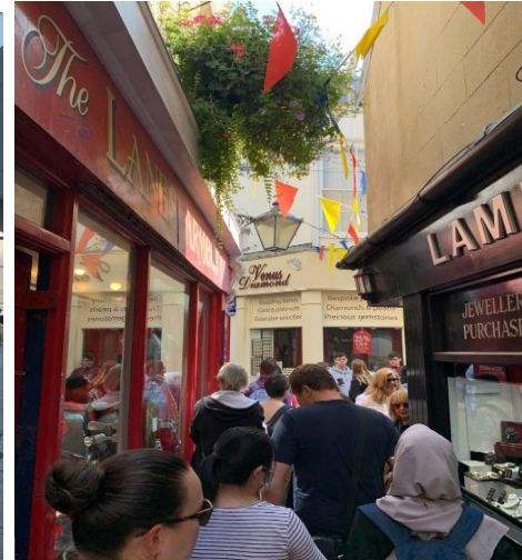
Day trip to Brighton