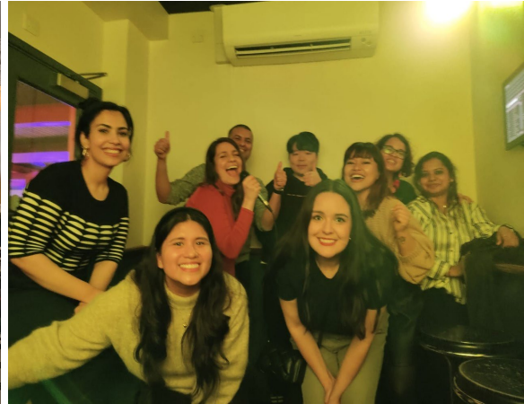
Karaoke by the Student Union